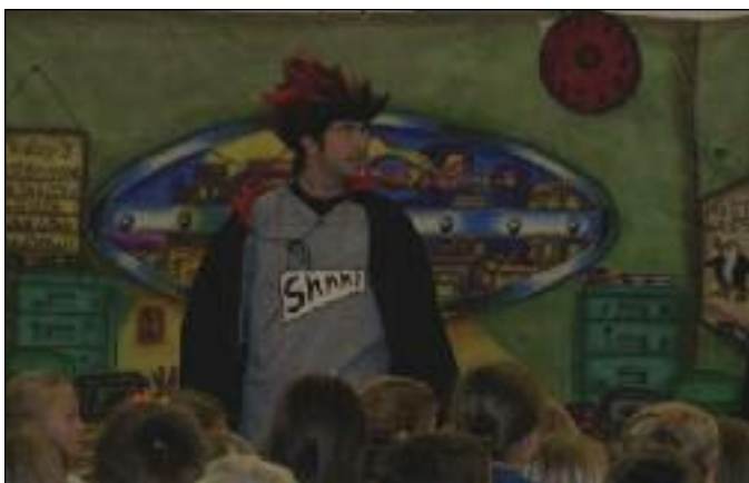
The Sneaker is on the prowl ...

Area schools that did not sign up for the fall performance will have an opportunity to schedule the show for this spring.