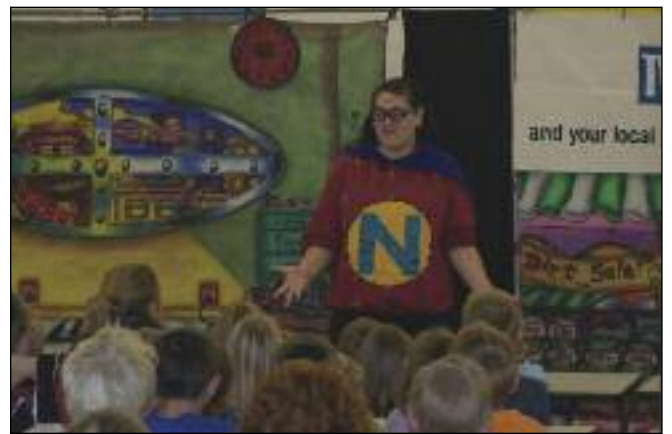
... so Nikki Neutron is called to help save the day.