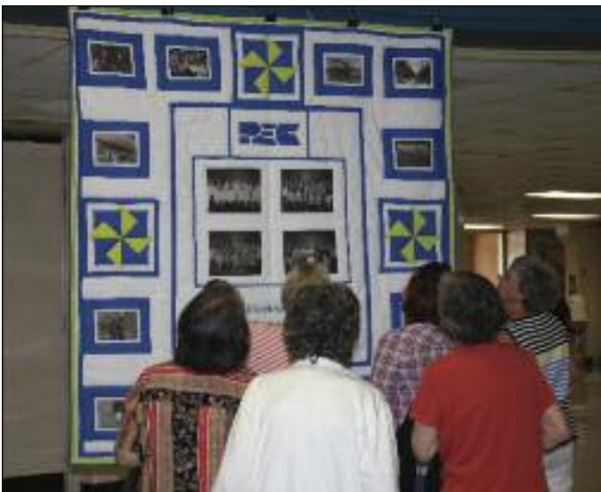
PEC members admire the 75th anniversary quilt made by the Needles & Pins Quilting group of Bethel Springs.