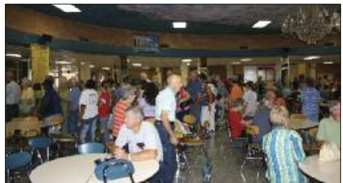
A large crowd attended the 2010 annual meeting.